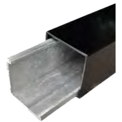
L- POST NO DIG INSERT